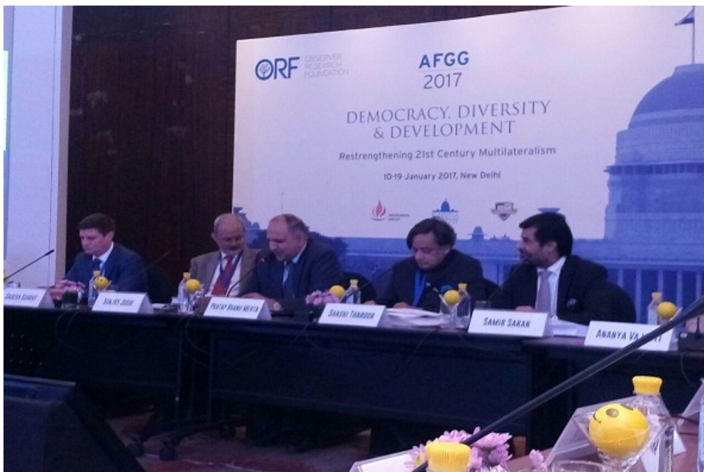
Outline India @ Asian Forum for Global Governance